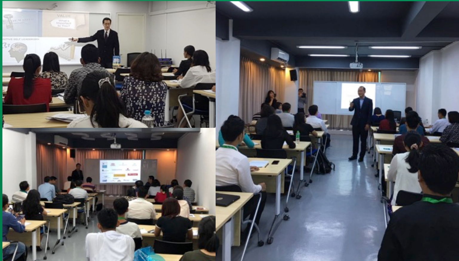
Executive overview sessions