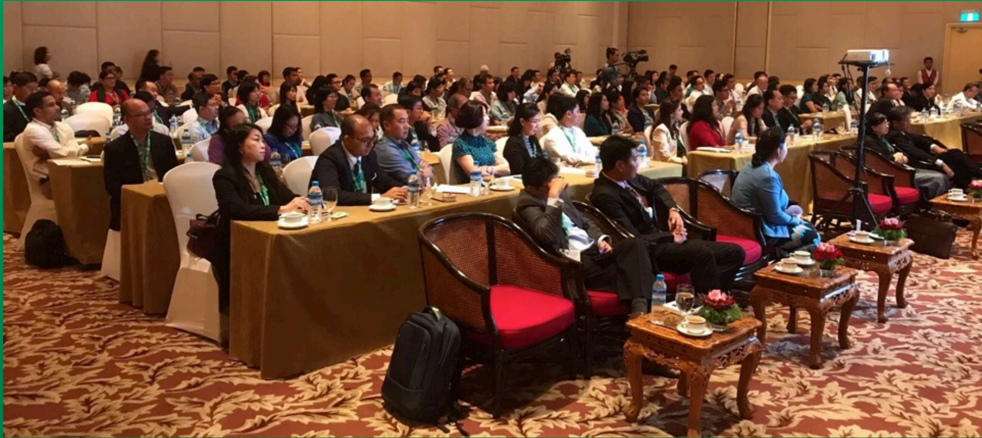
Professionals from Myanmar who attended the Conference.