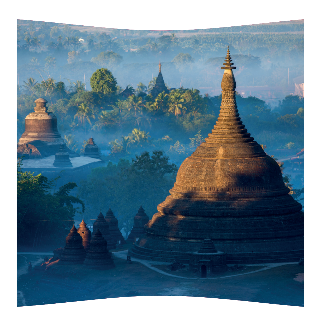
Luther in Myanmar